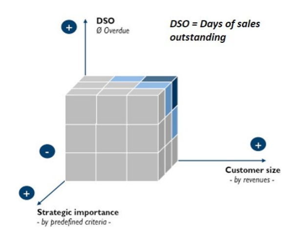
Figure 1: Illustrative cube for customer segmentation, selecting high-impact customers

Related to these shortcomings, some companies attempt to address these issues with a twodimensional customer segmentation process. However, the majority of these companies fail to include the right analyses and metrics and, therefore, do not realize the benefit from this process. The better approach is demonstrated by the enhanced customer segmentation cube that I developed. The cube includes three dimensions: average overdue, customer size and customer's strategic importance.